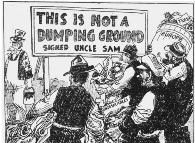
From the May 16, 1923, edition of the Klan newspaper, Fiery Cross .

Things became truly ugly in the 1920s, when the hysteria about undesirable aliens reached a pitch as fevered as it is today. Congress passed the Reed-